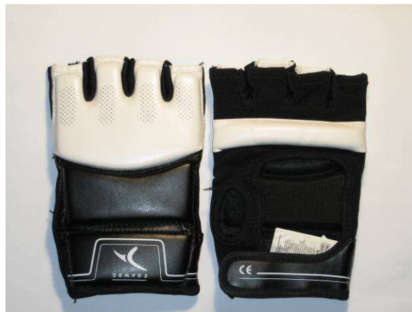
GLOVES (FROM 14 TO 17 YEARS OLD)

Another type of protections will be allowed if they offer the same level of protection.