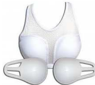
CHEST PROTECTOR FOR GIRLS