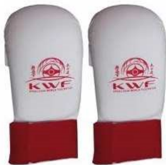
GLOVES (FROM 12 TO 13 YEARS)