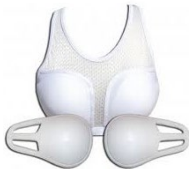
Homologated breast protection for women